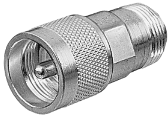
Type N Female to UHF Male Adapter