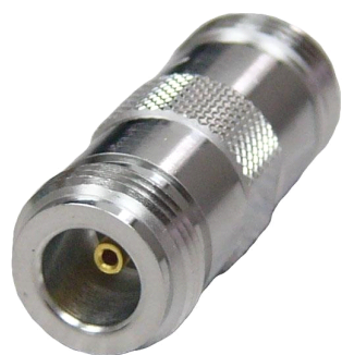
Type N Female to Type N Female Adapter