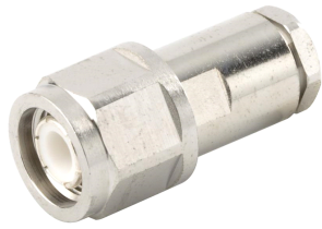
TNC Male for CNT-195 braided cable