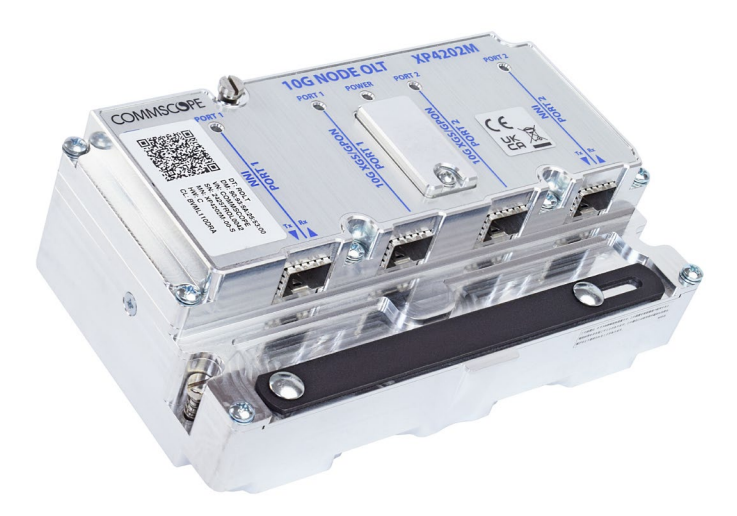
CommScope PON Evo 200 Series R-OLT

The 200 Series OLT utilizes standard 10G Ethernet uplinks, including CWDM, DWDM, and Bi-Di, for connecting to a Leaf Aggregation switch/router in the Converged Interconnect Network (CIN). This capability enables cable operators to utilize their transport backhaul fiber resources efficiently while extending the deployment of FTTX to serve customers at distances well beyond the typical 20 km reach of centralized, chassis-based PON architectures.