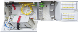
MOBI Fiber Optic Multi-Operator Building Enclosure, Operator Box