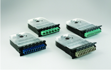
G2 Modular Cassette with 6 SC LazrSPEED® 550 Pigtails, Type B