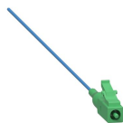
TeraSPEED® LC APC 0.9 mm Pigtail, blue, 1.5 m