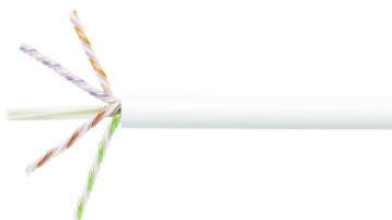
GigaSPEED X10D® 2091B ETL Verified Category 6A U/UTP Cable, 4 pair count