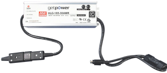
Power Supply Adapter ION®-B Series Remote Units, 150 W