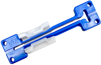
Fiber clamp, 2.0 mm