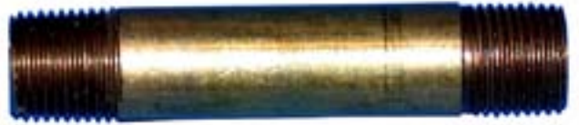
Long Nipple 1/8 NPT x 2"