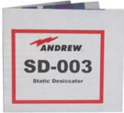
SD-003 Static Desiccator