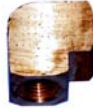
90° Union Elbow 1/8 NPT