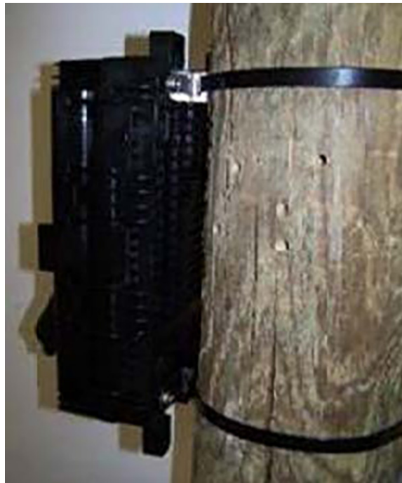
Figure 2. Pole-Mounted Mini-OTE 300 Terminal Enclosure