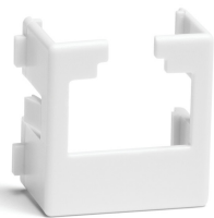
HGS620 M-Series Adapter, White (25 ea/pkg)