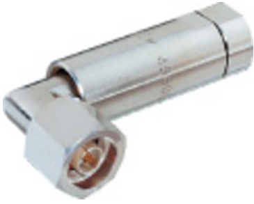
Type N Male Right Angle for 1/2 in cable