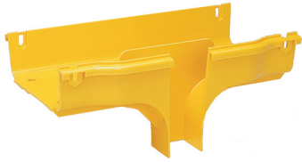
FiberGuide® Downspout, 2x6 to 2x2in Exit, Yellow