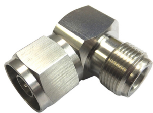
Type N Male to Type N Female Right Angle Low-PIM Adapter