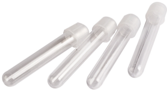
Music Wire, 4 vials+C19