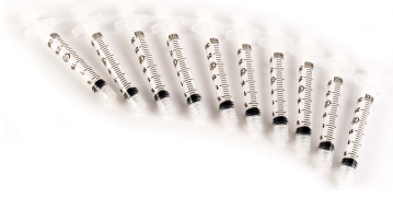
Syringe, 3CC, quantity 10