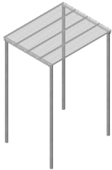
Ice Canopy, 10 ft x 10 ft, four 13 ft 4 in burial pipes