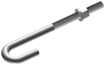
J-bolt Kit, 8 in