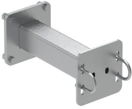
Stand-off Arm with U-bolts, 18 in