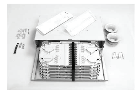
ETSI mounting brackets (not shown) are also included