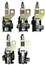
Mini-OTE 300-Series, Optical Terminal Pole Cable Retention Kit