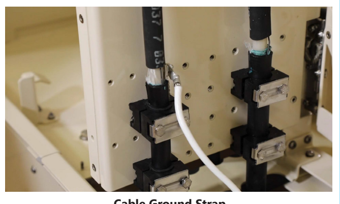
Cable Ground Strap

5.5 Remove ground straps from cables and ground locate panel. (2 Pictures)