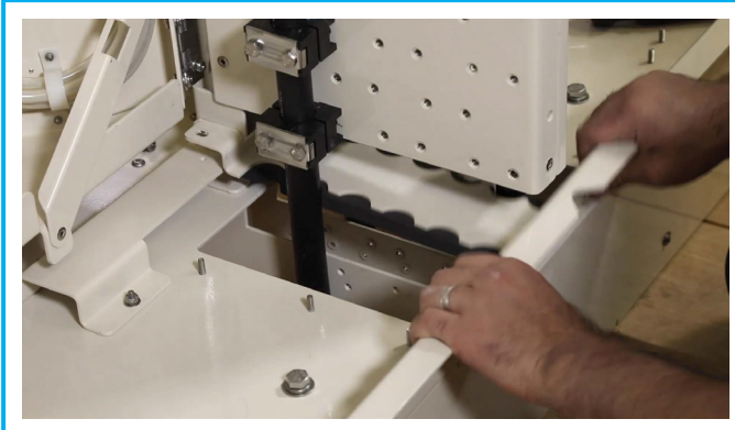
Re-attach RHS Bottom Plate