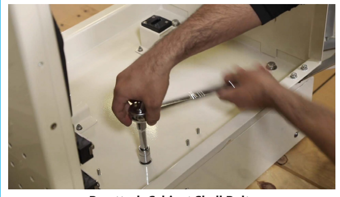
Re-attach Cabinet Shell Bolts