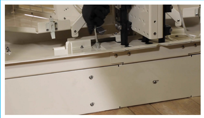
LHS Rear Plate Removal