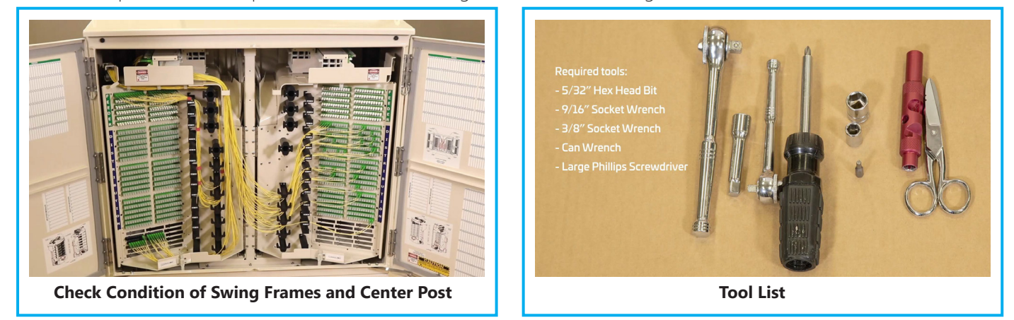
Note: If the riser is damaged a new riser kit will need to be ordered separately.

5.2 Inspect the internal parts of the FDH. The swing frames need to be in good condition.