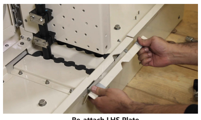
Re-attach LHS Plate