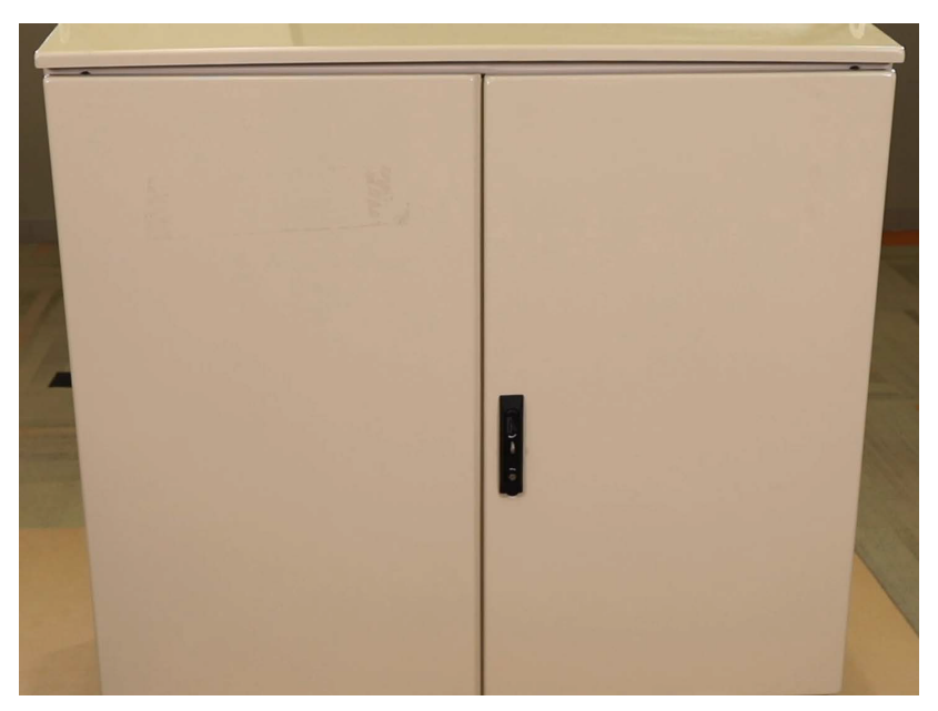
864 FDH 3000 Cabinet