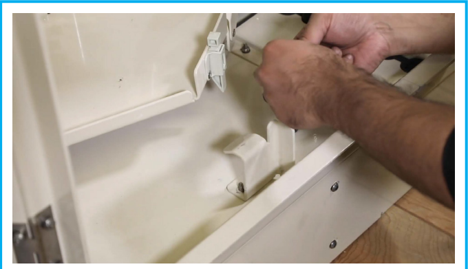
Remove Tape from Swing Frame Latches