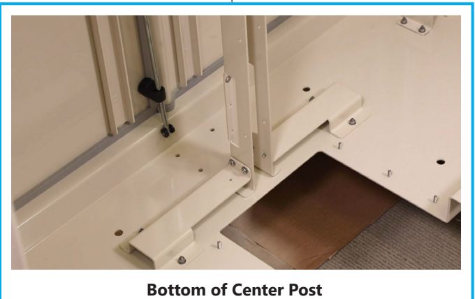
Center Post Removal

Page 6 of 9 © 2021 CommScope, Inc. All Rights Reserved