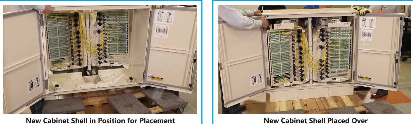
New Cabinet Shell in Position for Flatement