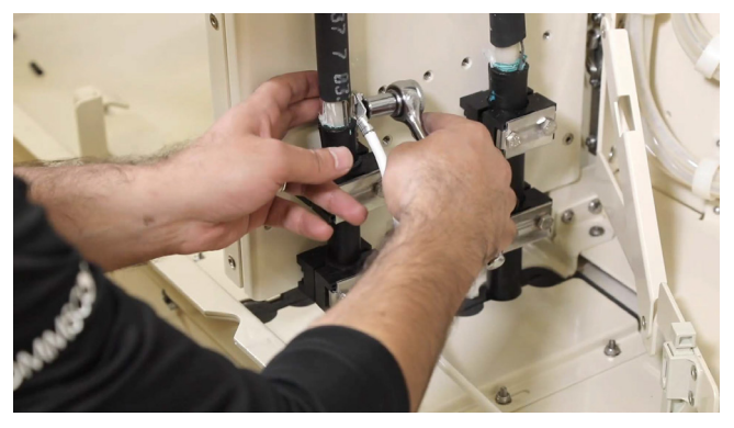
Re-attach Ground Wire at Cable