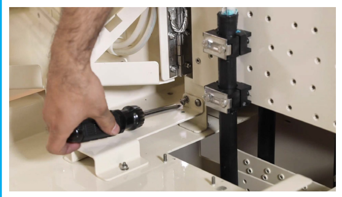
Bottom Center Post Hardware Removal