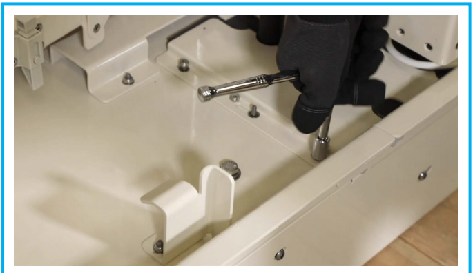
LHS Rear Plate Removal