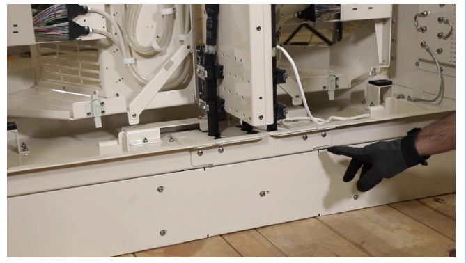
Hardware Removal on Rear Side