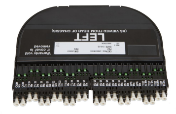
NG4access Splitter Module

Splitter VAMs are used to split (or combine) optical signal power from one fiber to multiple fibers. NG4access VAM splitters can be used for signal distribution in PON networks or for redundant path route protection. NG4access splitter VAMs occupy up to three access trays in the universal chassis and snap easily into place.